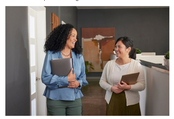
Element VI: Effective System for Routine Monitoring, Auditing, and Identification of Compliance Risks

Disciplinary standards must be communicated on an ongoing basis, not simply during an initial or annual training or in policies that not all may receive. Example communication methods include: newsletters, regular presentations and as an agenda item in staff meetings, communications with downstream entities, general compliance training, as well as prominently displaying the information on an intranet site and posters throughout work and break areas.